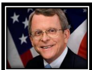
MIKE DeWINE Governor