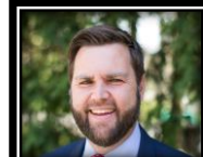
JD VANCE US Senator