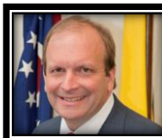
PAT DeWINE Justice Ohio Supreme Court