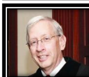
PAT FISHER Justice Ohio Supreme Court