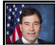
TROY BALDERSON US Representative District 12