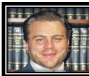
ANDREW KING Judge Court Common Appeals District 5