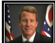
JOHN HUSTED Lt. Governor