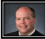
CRAIG BALDWIN Judge Court Common Appeals District 5