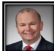
ANDREW BRENNER State Senator District 19